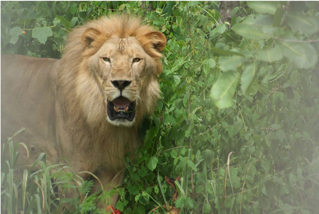
The Lion Enclosure