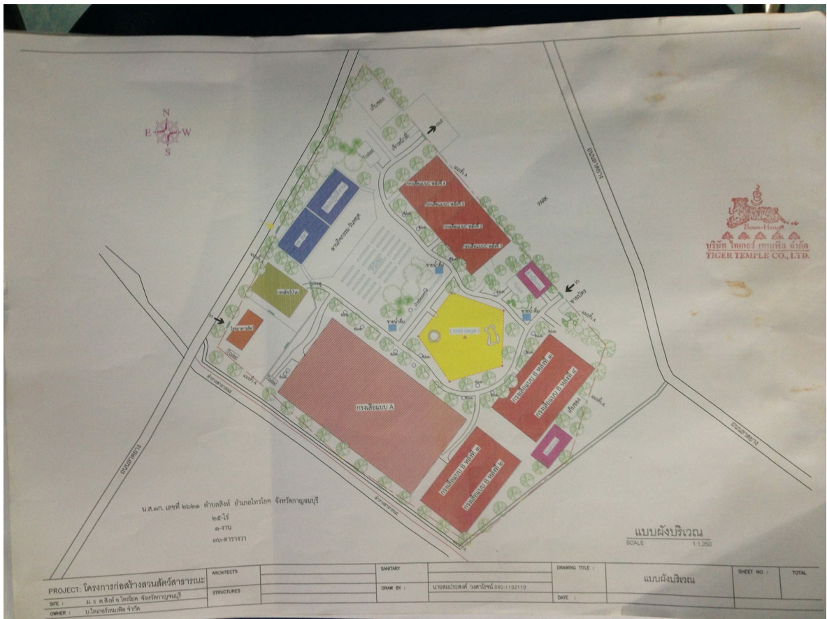
The new zoo design