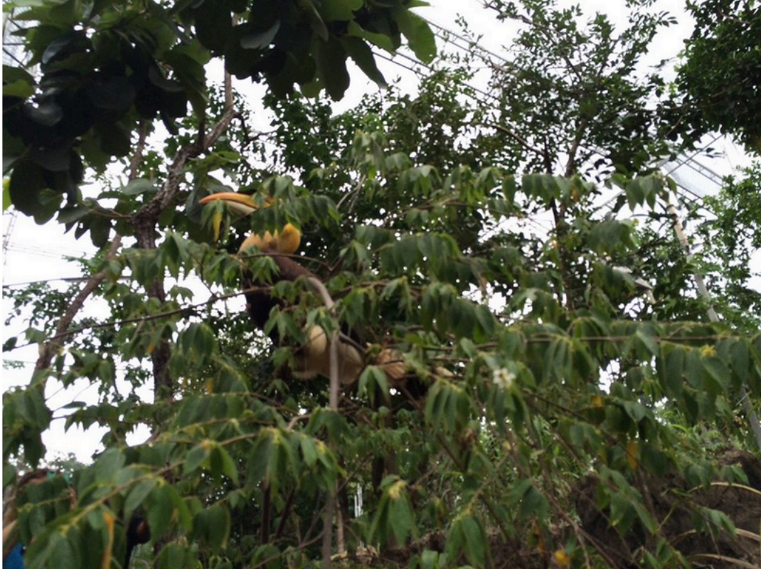
The Hornbill Aviary