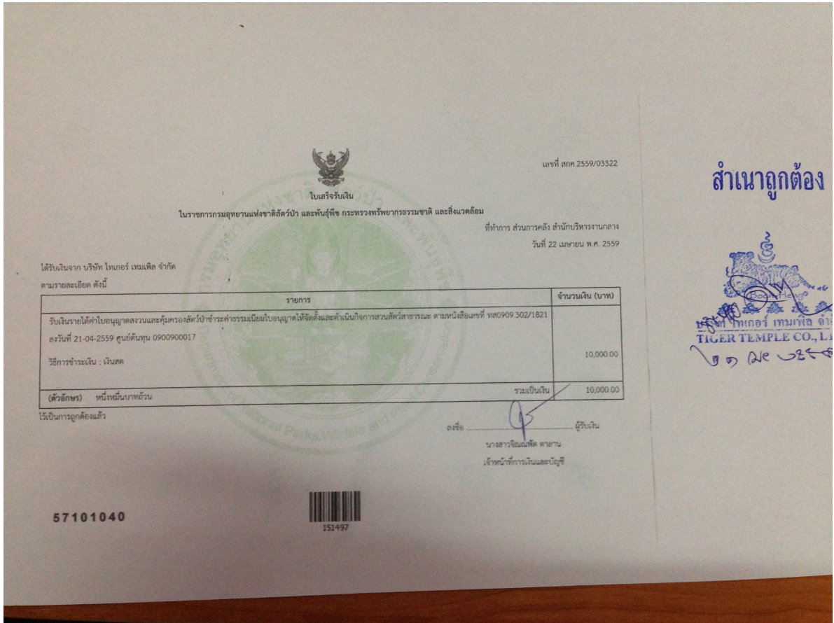
The Zoo License receipt